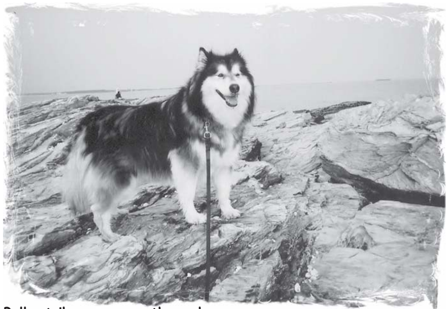
Belle strikes a pose on the rocks.

Belle had a very nice time at Bark in the Park and was snoozing on the way home.