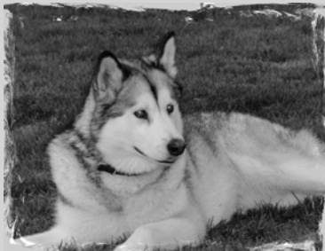
Kaya, "the perfect pooch."

After reading the winter 2010 edition of Tales, I decided to send this update and picture.