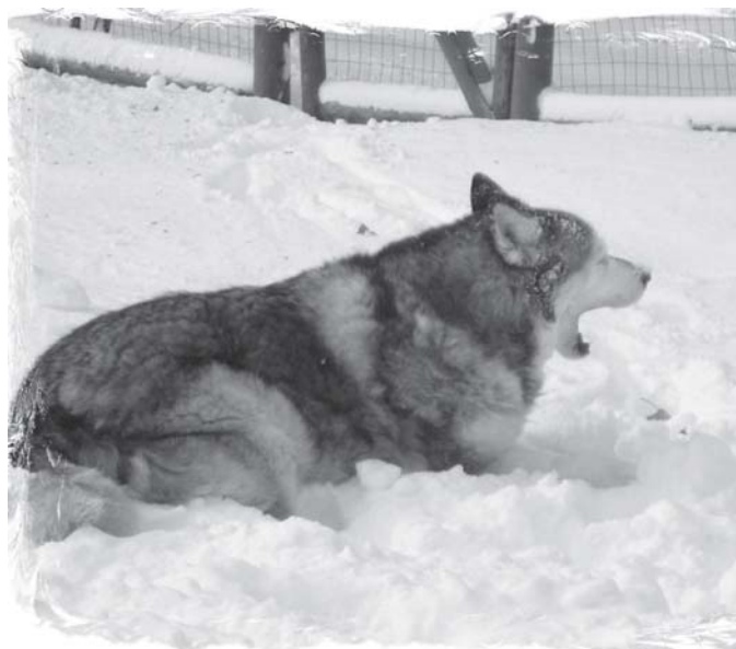
Lobo, in his favorite season of the year