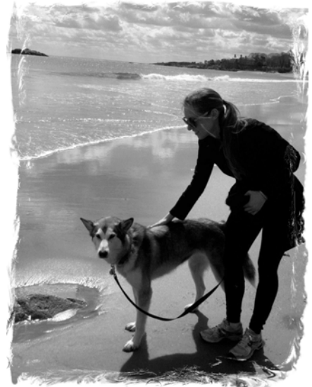
Bena goes to the beach.

Life is pretty good! I go for a run every morning, my new dad works from home, I meet new people and dogs every day, and I'm really working on building up my confidence. My people tell me that I'm going to keep working with my dog trainer and one of my owners wants