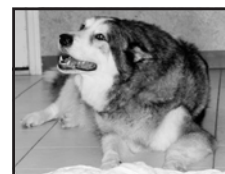
Jake 9-year-old male

At press time we had some new dogs entering rescue. We can't tell you a lot about them here but you can see updates on our website.