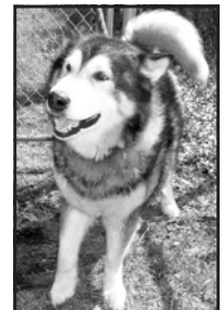
Tonka 6-year-old male