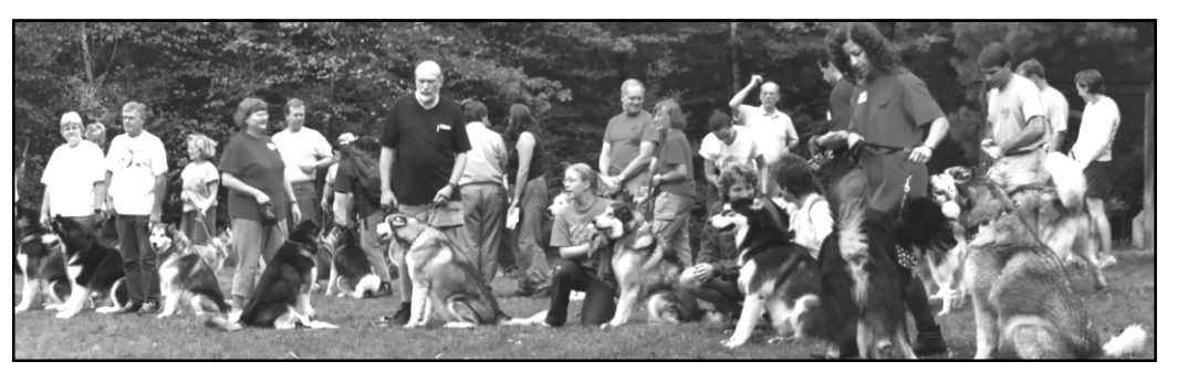
Mals and other dogs line up with their owners for a Camp N Pack photo op.

• Camp: A group of costs associated with running Camp N Pack. This includes the rental of Camp Timber Trails, and the food and supplies purchased for the weekend. These costs are all paid in full by the charges for camp attendees.