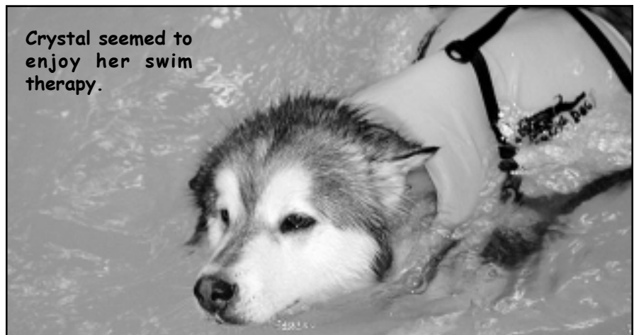
Crystal seemed to enjoy her swim therapy.

At last report, Crystal continues to attend aquatic therapy, resulting in a good range of motion and she is off her pain medication and totally pain free. Its hard to tell who is happier in this family — Crystal or the adopters.