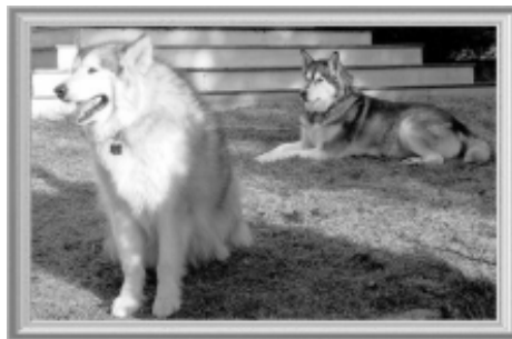
Anaki, left, and Nikita take a break.

The two dogs are great with one another, with Amaki usually deferring to the smaller Nikita, except when petting is involved at which time he must be a recipient. The dogs especially enjoy running on the beach in Hingham, where we live, and exploring Wompatuck State Park – seven square miles of woodland under a mile from home. Needless to say, everyone loves Amaki.