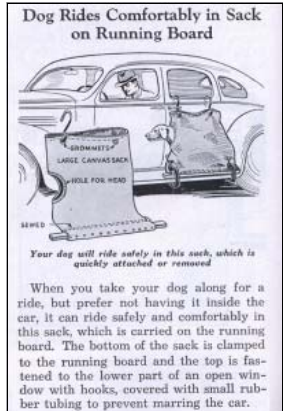
This how-to illustration actually appeared in a 1936 issue of Popular Mechanics.

10. Make sure you have any paperwork that you need before you set off to pick up a dog. AMRONE must have a release form signed by the owner or shelter whenever we take ownership of a dog.