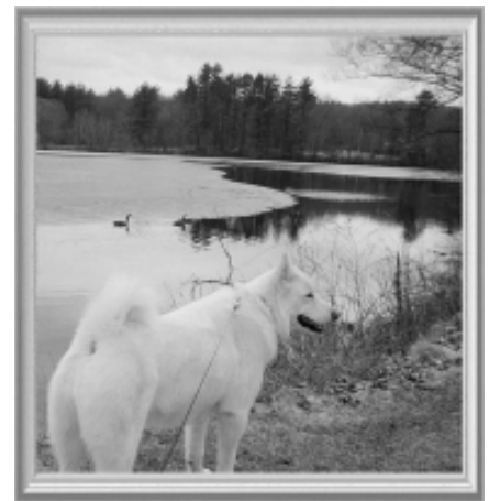
Kiska soaks up some scenery.

We like to call Kiska our "anti-malamute." She's quite the watchdog, she's not a thief (well, there was that grape tomato episode, but only that one time) and she loves vegetables, especially carrots. And because she loves carrots, winter is her favorite season for two reasons – all the snow AND all the snowmen with carrots for noses!