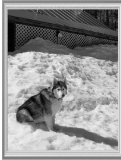
Samson, the king of his hill.

I am delighted to report that both Nikita and Amakitartut are doing splendidly! Nikita has a few more grey hairs (her estimated age is now roughly 9 years) but she retains her huntress instinct (her most recent kill was within the last three weeks). Amaki remains the most wonderful, friendly, large beast imaginable. He has had no health irregularities since the time of his joining the family late last July. He continues to be an eating machine – his weight is 100 pounds (up from 68 pounds), and it has held at that level for the last six months. Yet he runs like the wind!